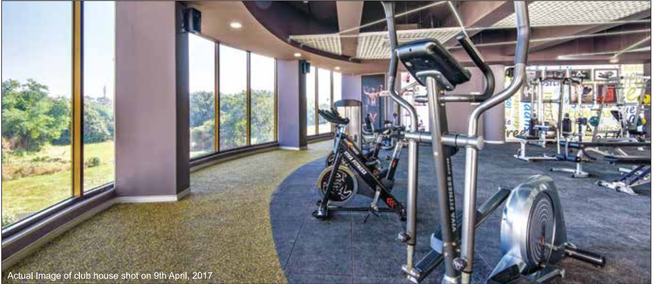
Actual Image of club house shot on 9th April, 2017

Amenities at Amantra have been conceptualized and designed to cater to your every whim & fancy.