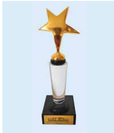
Best Promising Upcoming Project - Primanti, Gurgaon Estate Avenue Realty Awards, 2013