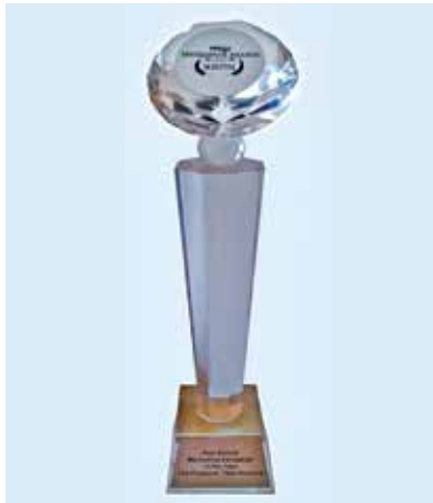
National Quality Award -Tata Housing Golden Peacock Awards, 2013

Has a diversified portfolio of more than 6503212.8 sq.mt. under various stages of development.