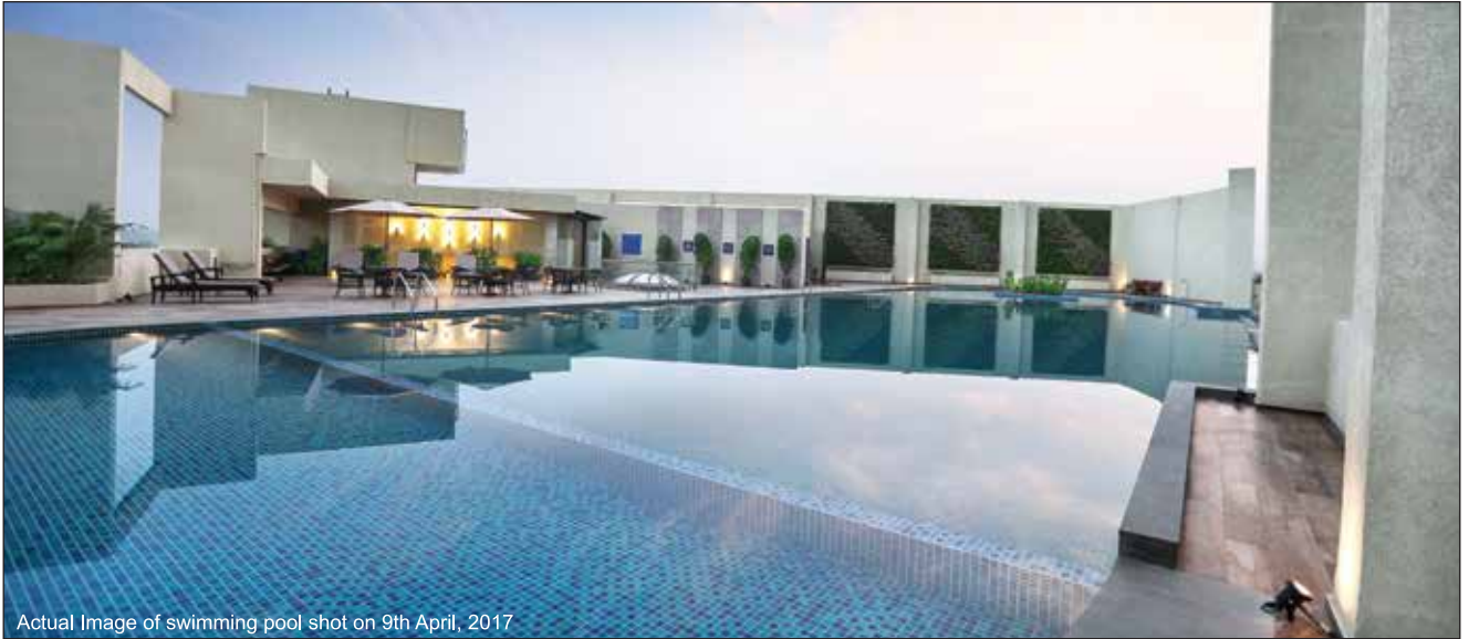
Actual Image of swimming pool shot on 9th April, 2017

Amenities at Amantra have been conceptualized and designed to cater to your every whim & fancy.